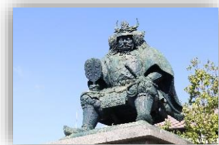
Warlord Takeda Shingen's statue is located on Kofu Station's southern exit