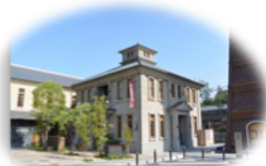
Koshu Yume Koji