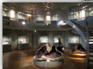
Crystal ▪ Museum