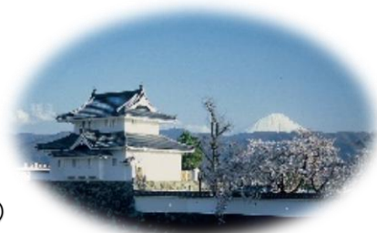
Maizuru Castle Park