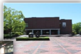
The Yamanashi Prefectural Museum of Art

Azusa #44 Dep. at 5:02 pm & Arr. at 6:45 pm