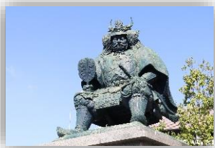
Warlord Takeda Shingen's statue is located on Kofu Station's southern exit