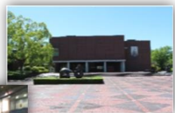
The Yamanashi Prefectural Museum of Art