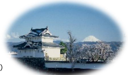
Maizuru Castle Park

Azusa #44 Dep. at 5:02 pm & Arr. at 6:45 pm