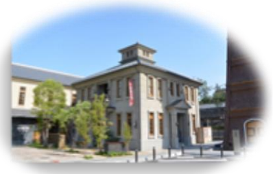
Koshu Yume Koji